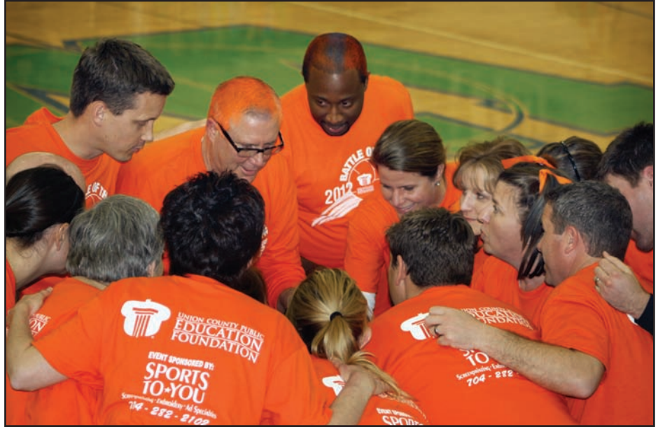
UCPS administrators and coaches from the Marvin Ridge cluster huddle during the first Battle of the Bosses volleyball game, a free-for-all fundraiser for the UCPS Education Foundation.