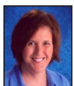
Emily Tucker Stallings Elementary