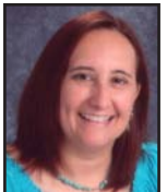
Teresa Antol Wolfe School