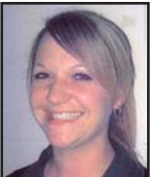
Heather Teff Monroe Middle